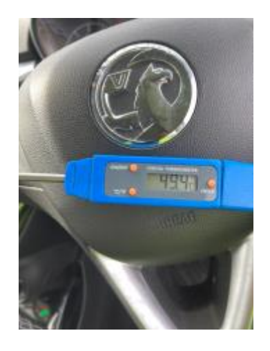
Temp Reading – Heaters on hot