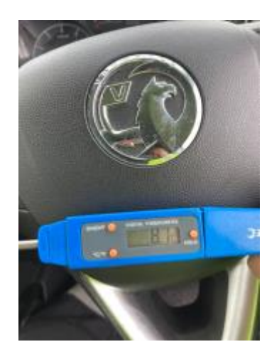
Temp Reading – Heaters on cold